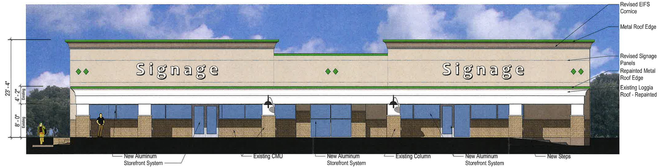
② Renovated Main St. Elevation 3/16" = 1'-0"