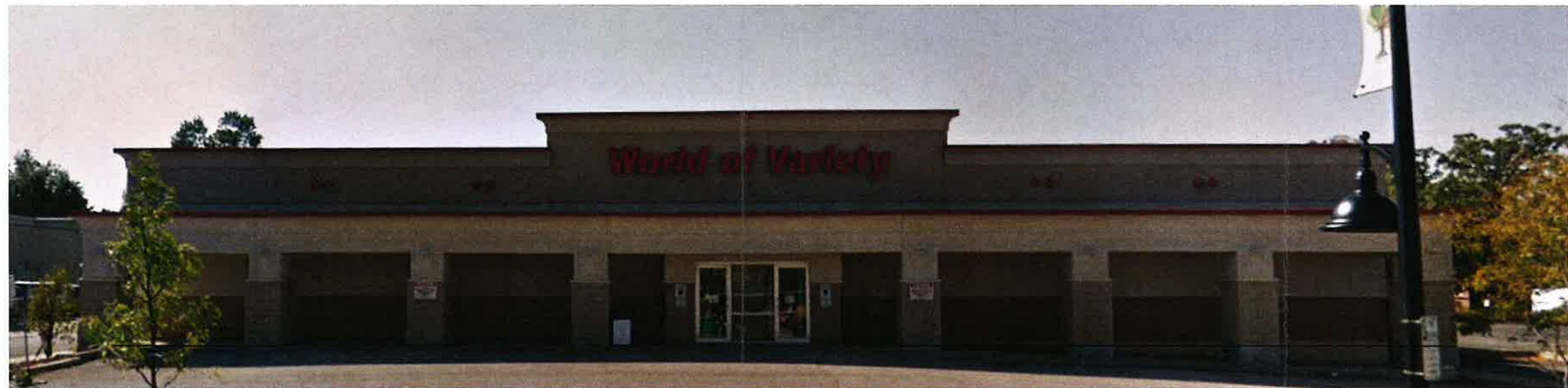
① Main St. Elevation Existg 3/16" = 1'-0"