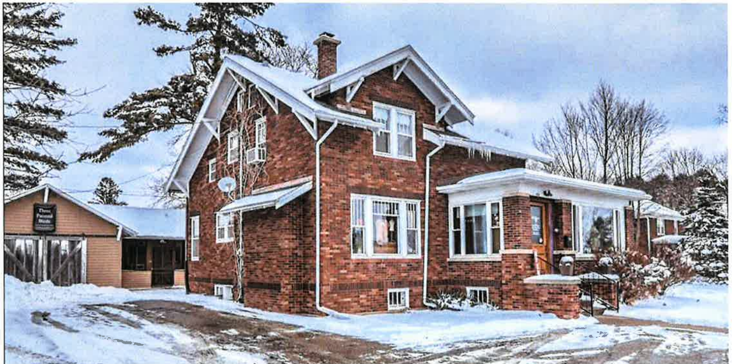
400 W Verona Ave, view from Verona Ave