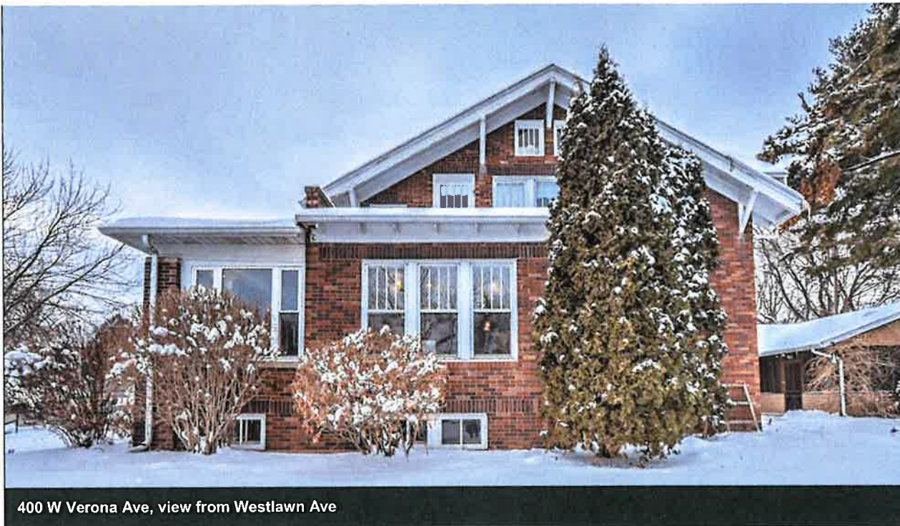
400 W Verona Ave, view from Westlawn Ave